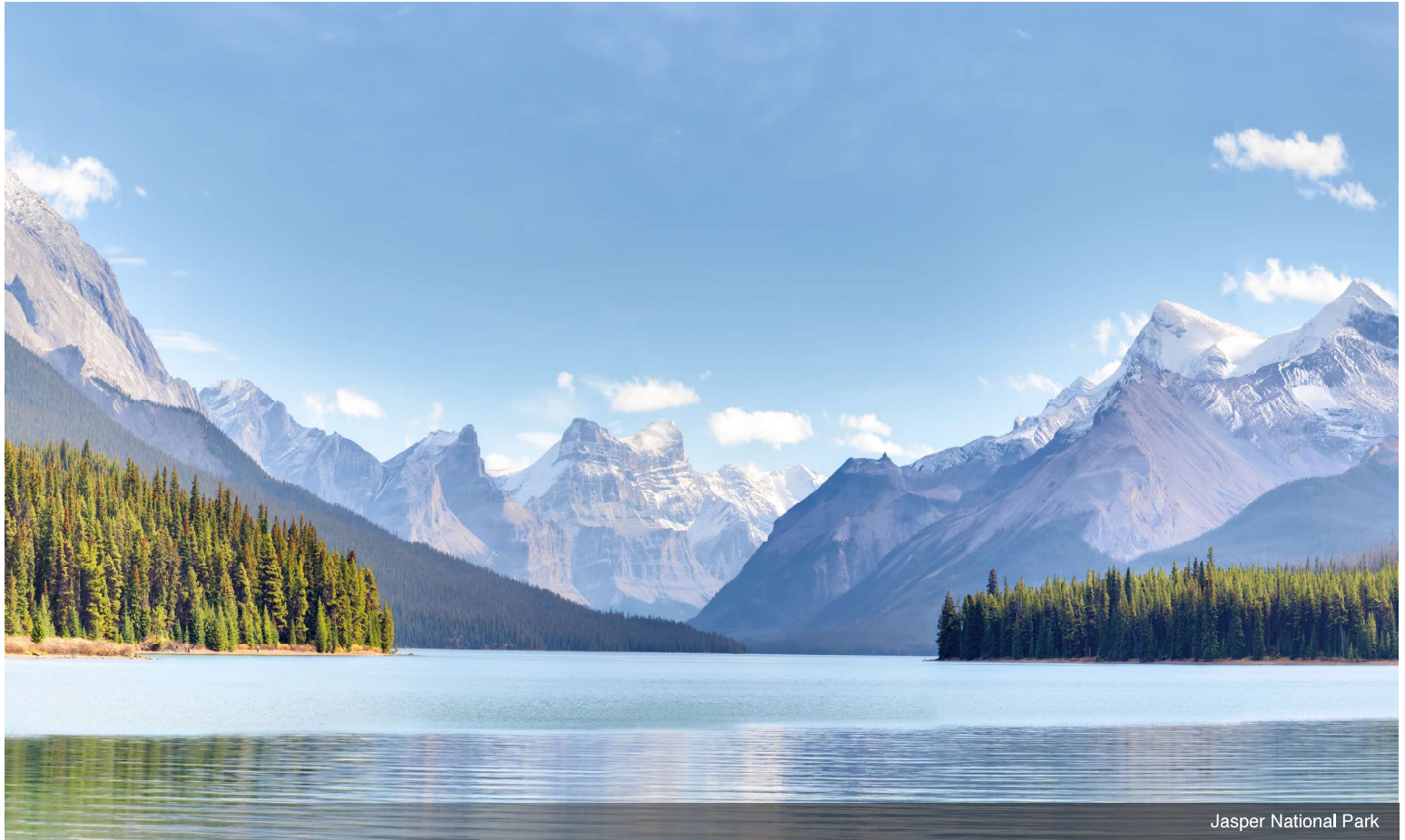
Jasper National Park