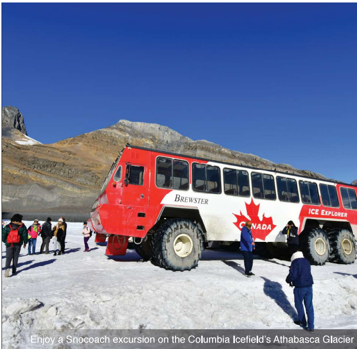
Enjoy a Snocoach excursion on the Columbia Icefield's Athabasca Glacier