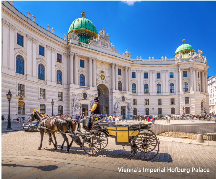
Vienna's Imperial Hofburg Palace

famous Ringstrasse. During the walking tour, stroll with your guide through the city center, a UNESCO World Heritage Site. Marvel at the classic architectural styles of the buildings, see St. Stephen's Cathedral and the Hofburg Palace, right in the heart of the city center. If you are feeling more active, opt to explore on two wheels, cycling along the serene trails on Danube Island. Meals: B, L, D