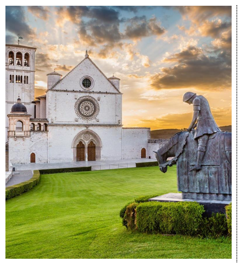
10 Days • 12 Meals: 8 Breakfasts, 1 Lunch, 3 Dinners

On some dates alternate hotels may be used.